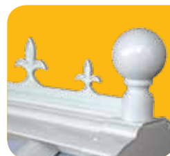
Ball finial and Shield cresting