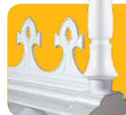
Global finial & Global cresting